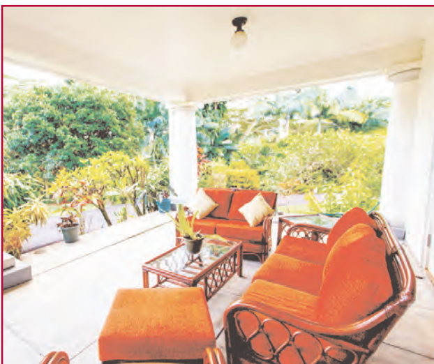
The Lanai (front porch)