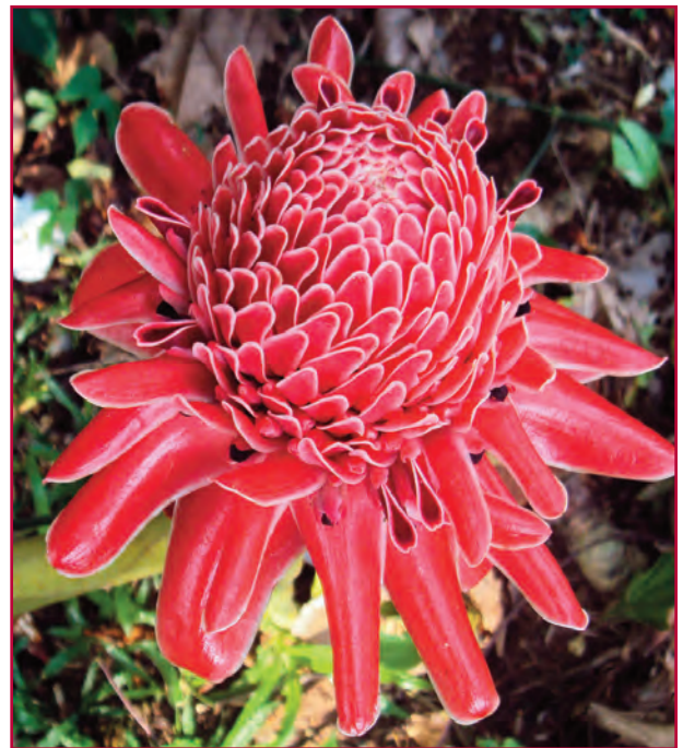
Torch Ginger, Hawaiian Tropical Botanical Gardens