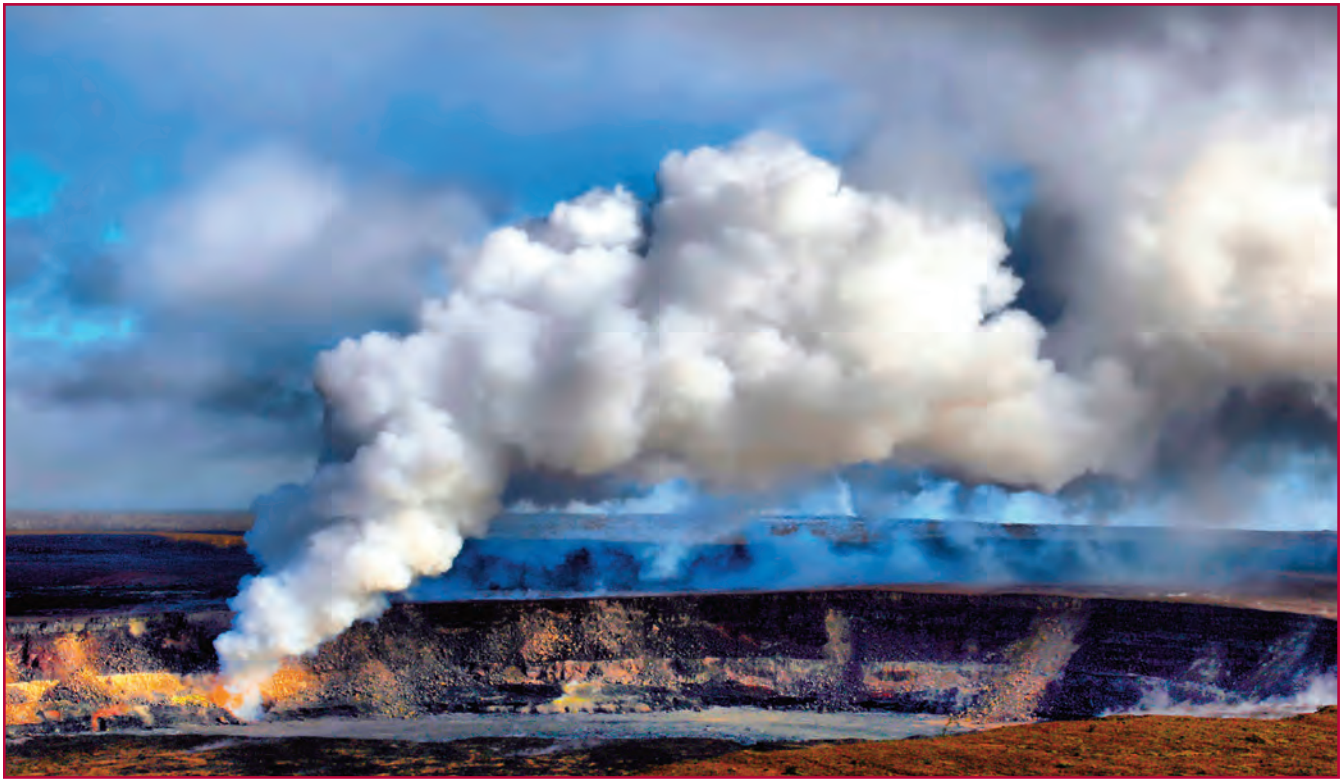
Halema'uma'u Vent, Volcanoes National Park

picnic lunch of local specialties and tropical fruit. Watch the sunset near the crater and marvel at the lava's glow. Then Settle in for a dinner overlooking the crater. (B,L,D)