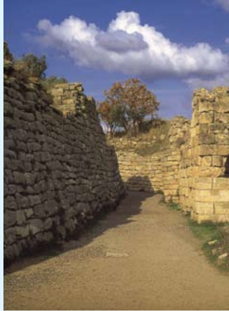
The walls of legendary Troy