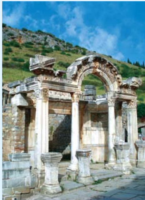
Temple of Hadrian, Ephesus