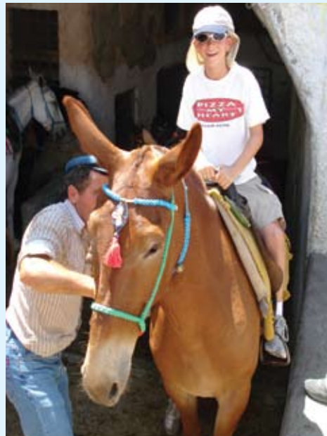
A Young Explorer in Santorini