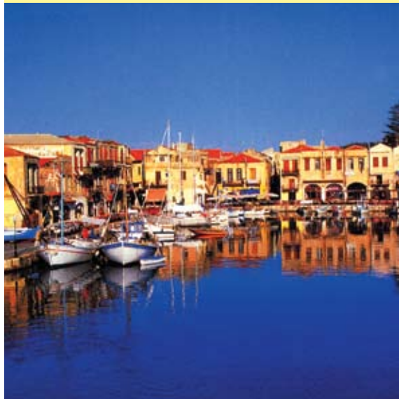
The inviting harbor of Rethymnon, Crete

NOT INCLUDED: Airfare; visa and passport fees; luggage and trip cancellation insurance; meals, soft drinks, and alcoholic beverages other than those specified above; personal expenses such as laundry, telephone calls, faxes, and e-mail service; and gratuities to shipboard personnel